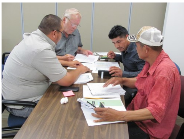
Hands-on training to develop a spray program using training notes and Enviroweather .