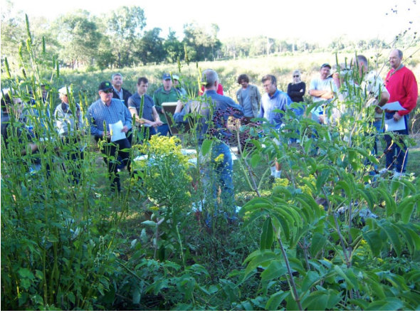
Ottawa County residents discuss priorities for protecting pollinators.