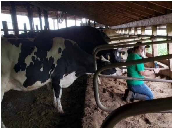
Data collection for the heat stress project at an Ottawa county dairy farm.