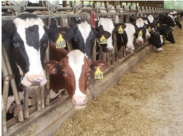
Cows bunked at a local Ottawa County Farm.