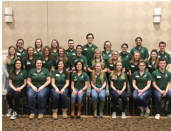
State 4-H Youth Leadership Council members kick off their year.