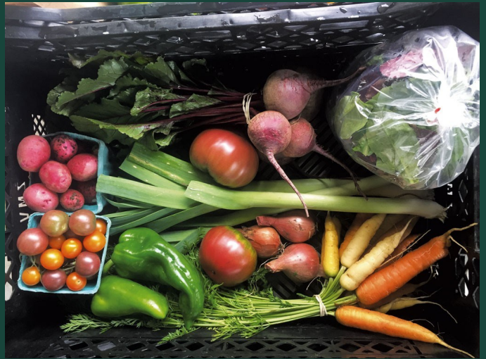
Photo: Example of a CSA Share distributed to the LOVE In the Name of Christ food pantry.

The issue: CSA to Pantry is a project that has been popping up across west Michigan for the past two years. The project attempts to improve food access for the most vulnerable populations of the region (food pantry users) by connecting them with local farmers who offer Community Supported Agriculture (CSA) shares. This not only helps improve access to healthy, locally produced fruits and vegetables, but is also set up to ensure that farmers can be paid a full price for their shares and have access to new customers.