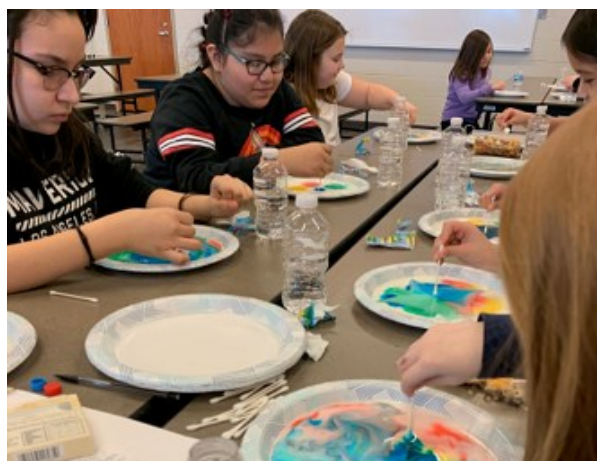
Youth at the Boys and Girls Club conducting a “Mysterious mixtures” project to see how oil and water don’t mix!