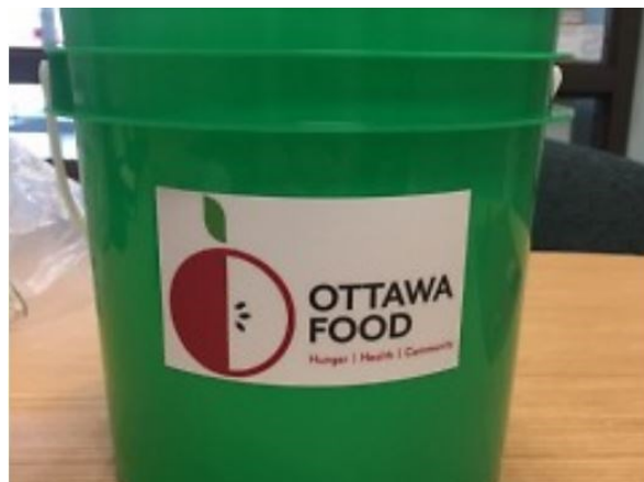
Blueberry bucket for U-pick for Pantries by Ottawa Food in partnership with MSU Extension.

MSU Extension Community Food Systems Educator, Garrett Ziegler, worked with Ottawa Food to develop a new program called Ottawa Pick for Pantries. The program includes a collaboration with four U-pick fruit farms in Ottawa County and several community resource centers and pantries. Many pantries lack access to fresh local fruit in their pantry donations and this program helped fill that need. Results included the donation and distribution of hundreds of pounds of local fruit to low-income residents through the Pick for Pantries program. This included strawberries, blueberries and apples from local farmers.